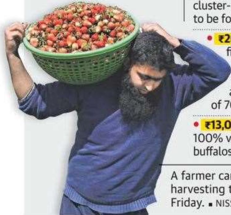
A farmer carries strawberries after harvesting them in Srinagar on Friday.

• Marketing reforms to be undertaken to provide adequate choice for farmers to sell produce at prices of their choice